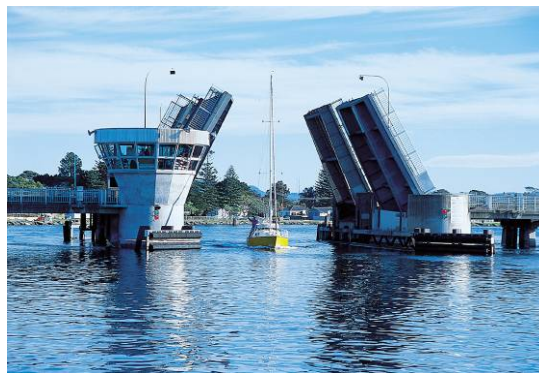
Figure 2. A picture is treated in the same way as diagram.

In all respects, pictures are inserted in the same way as diagrams. All pictures and diagrams are to be inserted in line with text.